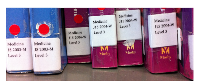
Happy library books